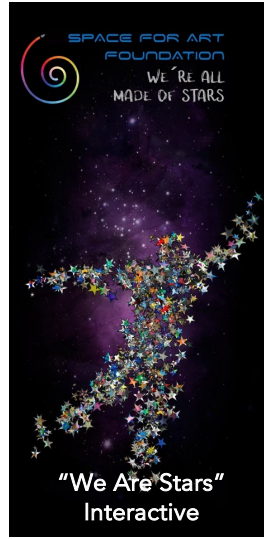
"We Are Stars" Interactive