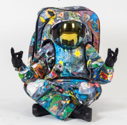
EXPLORATION Art Spacesuit