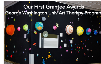
Our First Grantee Awards George Washington Univ Art Therapy Program