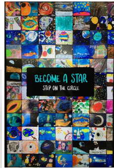
BECOME A STAR STEP ON THE CIRCLE