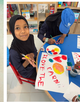
LOVE THE EARTH