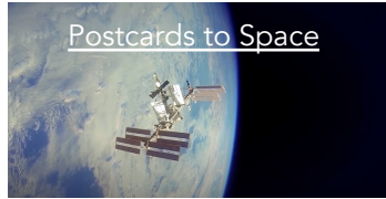
Postcards to Space