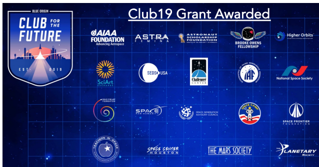
Club19 Grant Awarded