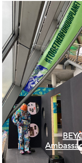
BEYOND Art Spacesuit Ambassador for Spaceship Earth at COP26